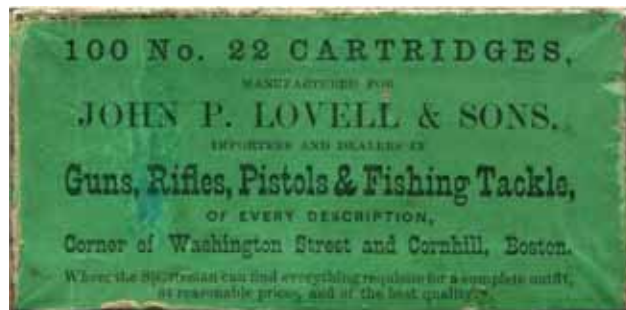
Original over-label from S-3 box