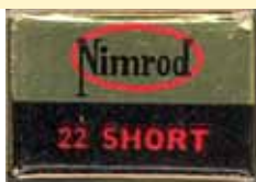
Box End Example