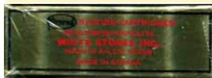
Box Back "A"