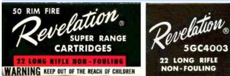
LR-1 Printing error. NO YELLOW on box