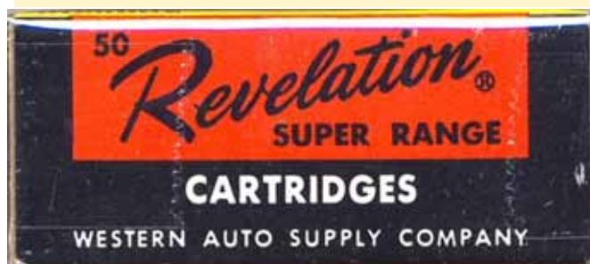
SIDE "A" (Goes with Bottom "A")