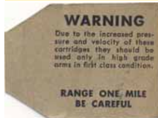
"A" Flap Warning