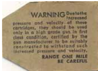
End Flap Warning

In 1962 the Consumers Product Commission required all ammunition boxes to carry a child warning . A label was affixed to existing boxes until the inventory was exhausted and new boxes could be printed that included the warning.