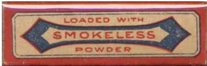
NUBLEND front & Back